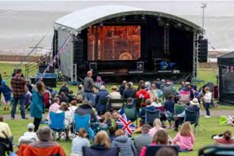
Community Event, Hunstanton