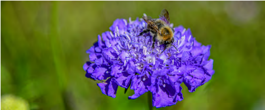
Wildflower and Pollinator Opportunities