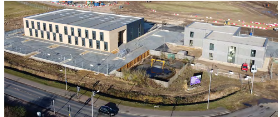
Enterprise Zone, King's Lynn