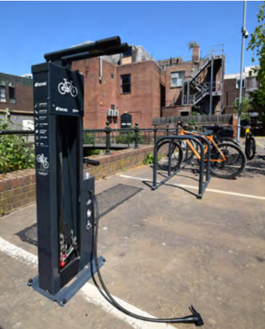
Baker Lane Active Travel Hub