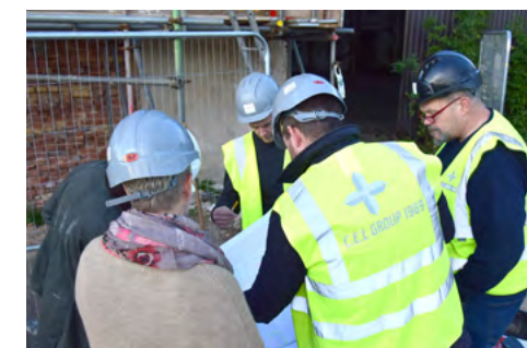
Sommerfeld & Thomas Building