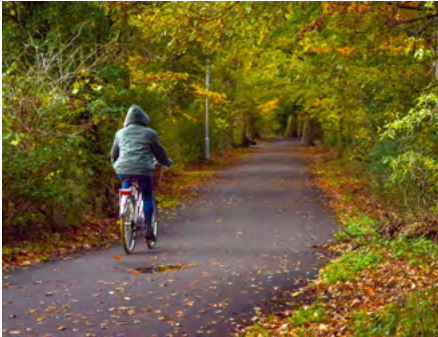
Cycleway, King's Lynn