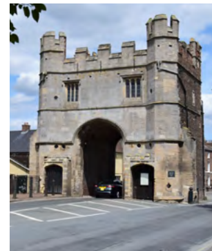
The South Gate, King's Lynn