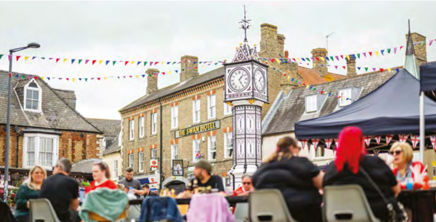
Community Event, Downham Market