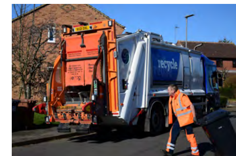
Refuse Bin Collection