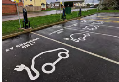
EV Chargers, Lynnsport