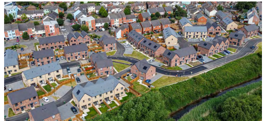
Nar Ouse Development, King's Lynn