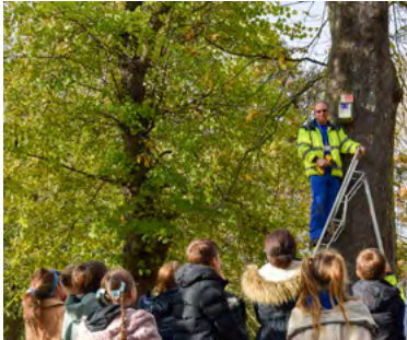
Installing Bird Boxes, The Walks