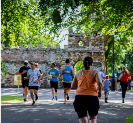
Park Run, The Walks