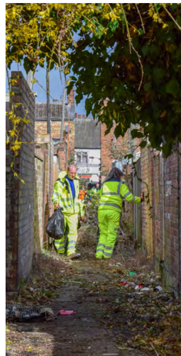
Clean-Up Team at Loke Road