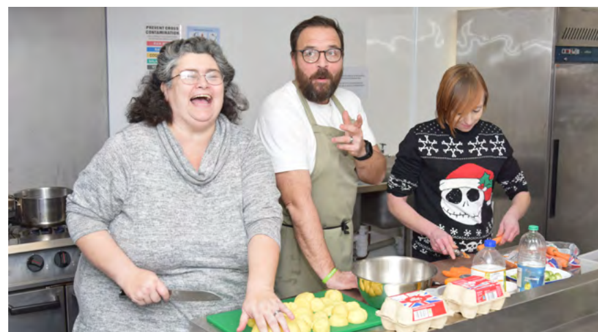
Food for Thought