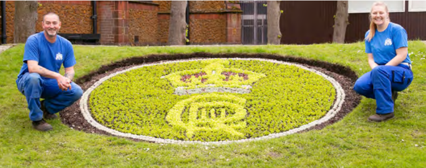
Coronation Badge Flowerbed, Tower Gardens